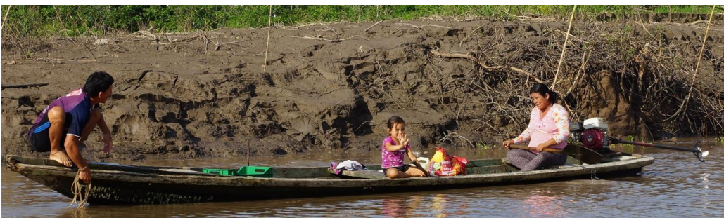
Local family fishing