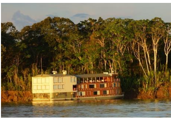
Home for a week