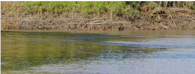
Confluence of a tributary (dark) and Amazon (brown)